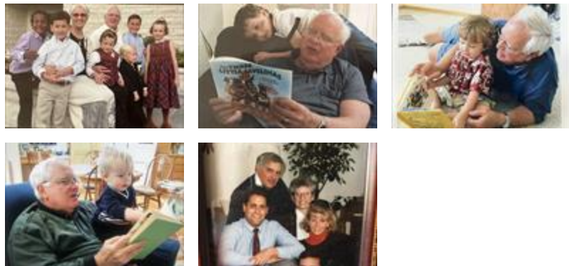
Adrienne - December 19, 2023 at 03:35 PM